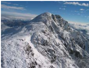
Ridge route in winter

You need to always be prepared for it to change, and modify your plans accordingly. The mountain will always be there, but if you try to summit in a lightning storm, you may not.